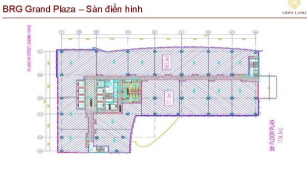
Typical floor of office building - commercial center