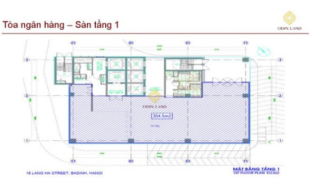
1st floor of the bank building