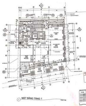
Layout of the first floor