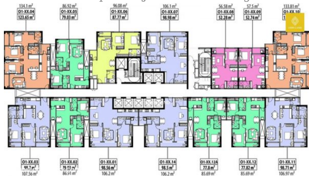
Floor plan of Orchid 1 building