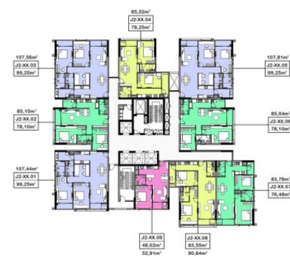
Floor plan of Jasmine 2 building