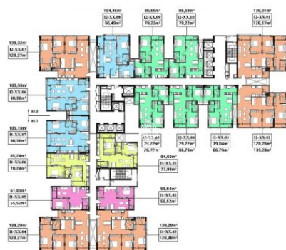
Floor plan of Iris 1 building