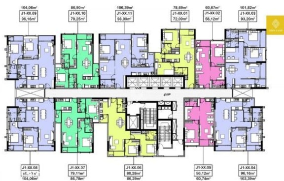
Floor plan of Jasmine 1 building