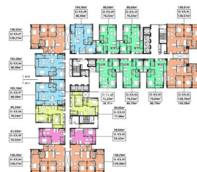
Floor plan of Iris 2 building