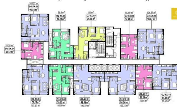
Floor plan of Orchid 2 building