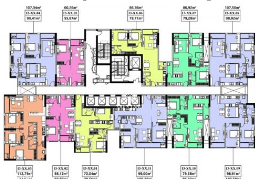
Floor plan of Iris 3 building