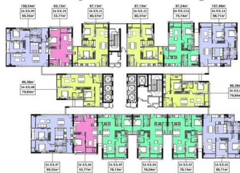
Floor plan of Iris 4 building