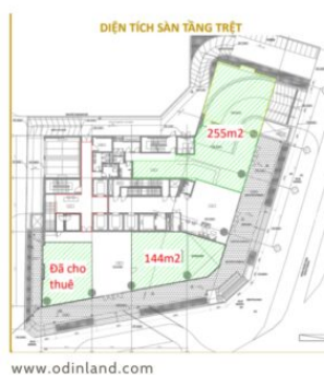
Typical ground floor and floor area in Unit